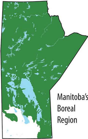
Map: MB Eco-Network GIS/Mapping Centre

The Boreal Region drapes over the northern shoulders of the globe like a green veil. Canada's Boreal is the largest continuous expanse of wildlands left on Earth and it houses 25 per cent of the world's remaining original forests.